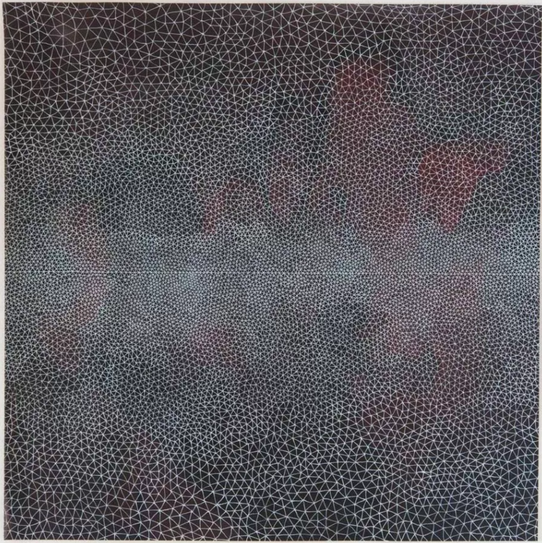
SAM MESSENGER, "HR.22.17", 2017, INK & SYNTHETIC POLYMER PAINT ON PAPER, 15H X 15W IN AT MAXWELL DAVIDSON GALLERY/ DAVIDSON CONTEMPORARY