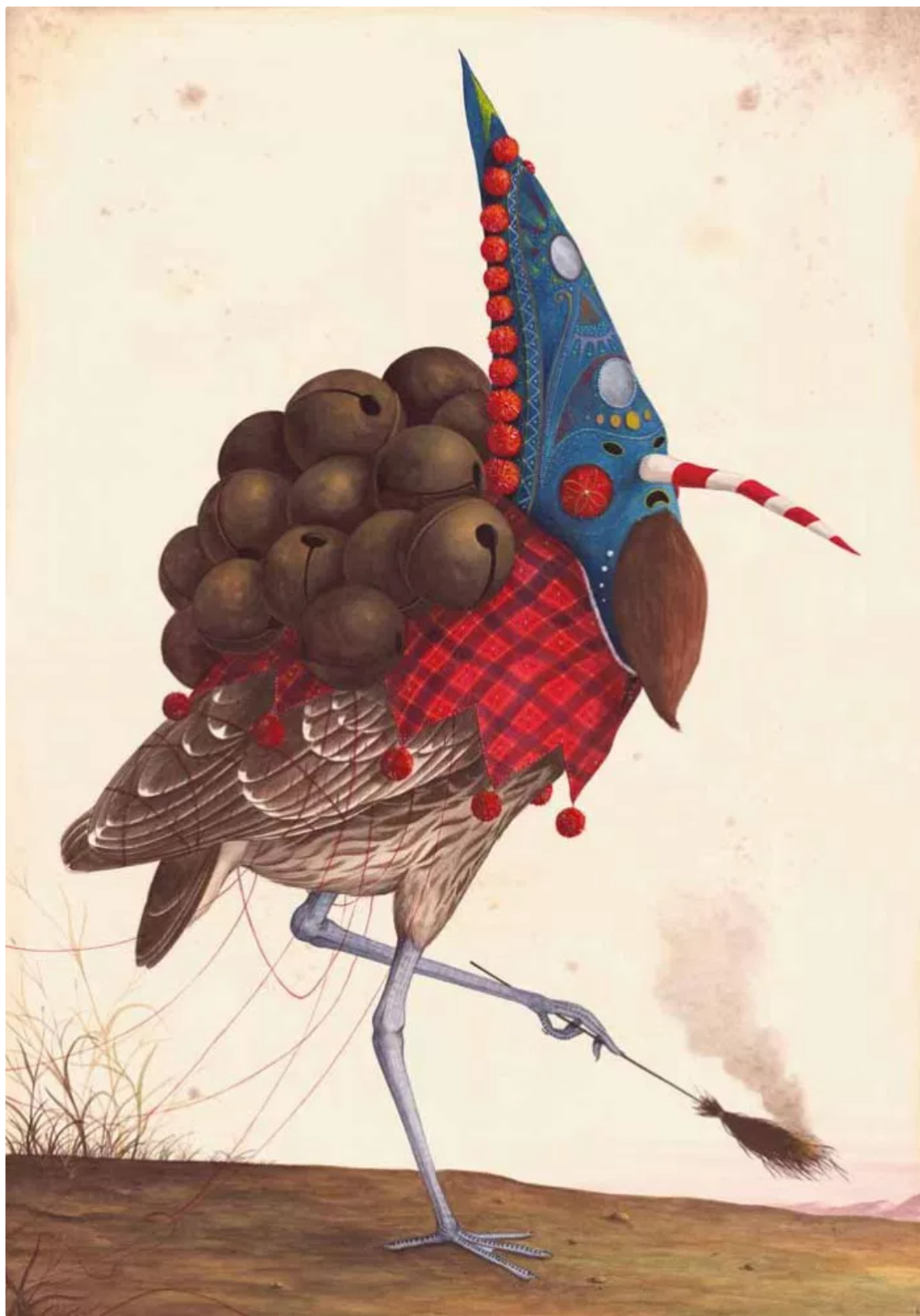
EL GATO CHIMNEY, 'LEZIONE DI SCRITTURA', 2015, WATERCOLOR AND TEMPERA ON PAPER, CM 140*100 (CRANE WITH MASK AND BELLS) AT GALLERIA COLOMBO