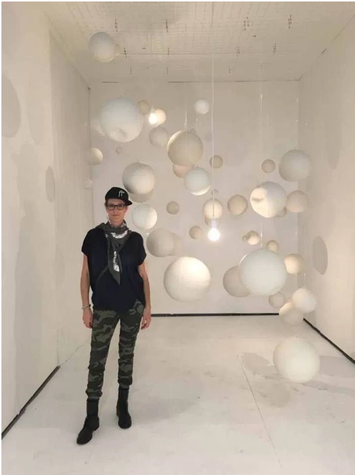
PHOENIX LINDSEY-HALL, "NEVER STOP DANCING", 2017, LIGHTS, SLIPCAST PORCELAIN, DIMENSIONS VARIABLE, INSTALLATION PART OF PULSE MIAMI BEACH PROJECT