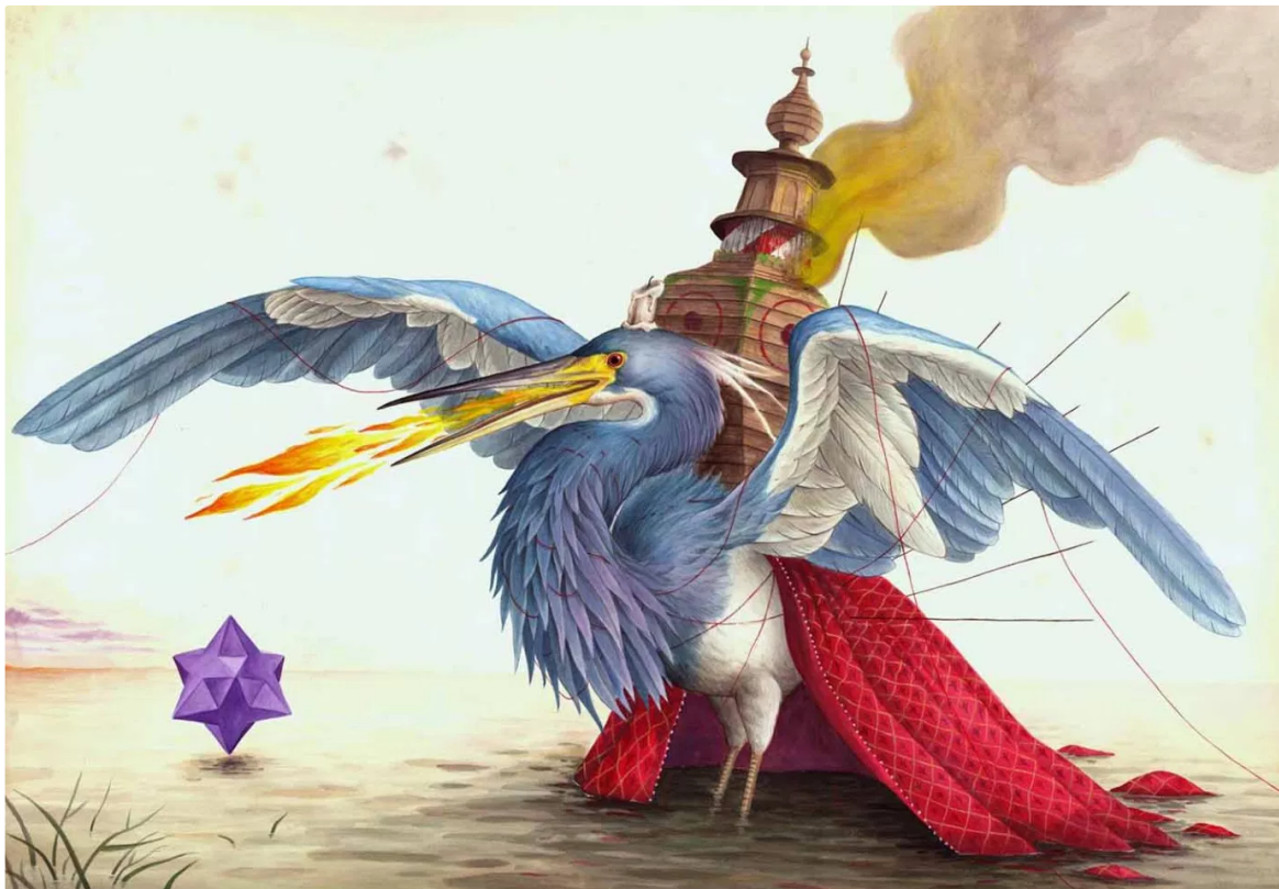
EL GATO CHIMNEY, "TRASFORMAZIONI", 2016, WATERCOLOR AND TEMPERA ON PAPER, CM 100×140 AT GALLERIA COLOMBO