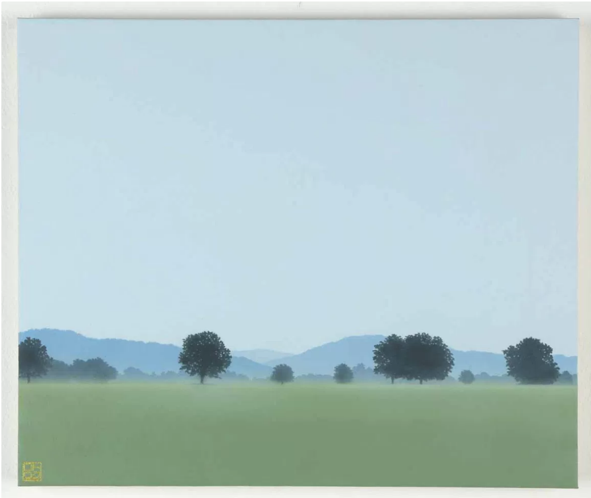
TOKURO SAKAMOTO, PADDY FIELD, 2017, ACRYLIC ON KOCHI HEMP PAPER, 25.0 X 30.0CM / 9.8 X 11.8INCH, GALLERY MOMO RYOGOKU