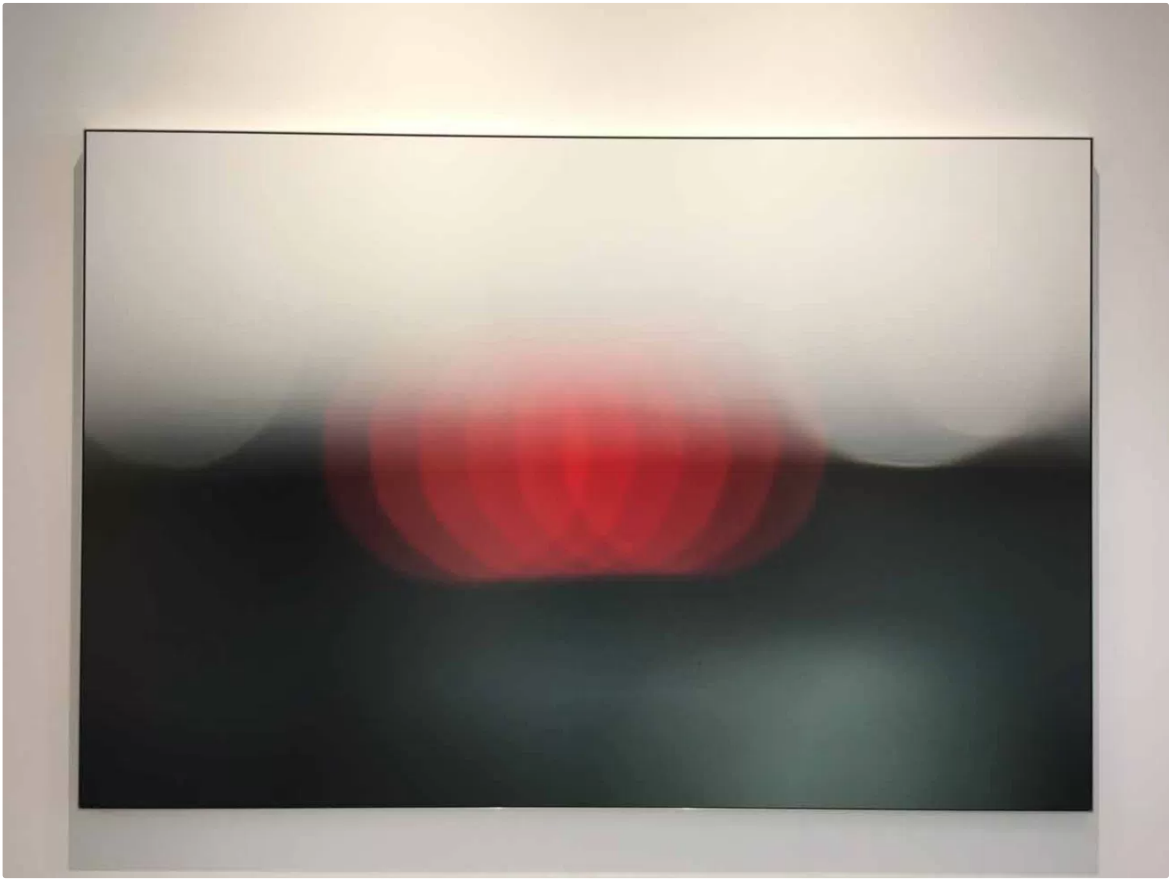
JIA, "THE ROAD SERIES 2 (NO.59)", 2010, FINE ART INKJET, 59.1 X 88.9 IN. AT TAUBERT CONTEMPORARY